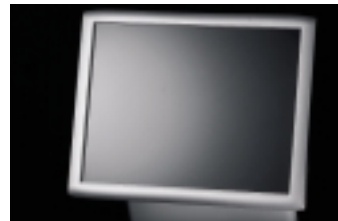
Pin sharp: the 15" TFT colour display features a digital link to the PC unit and combines outstanding image quality with superb ergonomics.