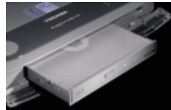
The integrated Plug & Play-compatible SelectBay slot provides maximum flexibility and a host of expansion options.