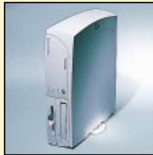
Intelligent design: the Equium 7300S case can also be positioned vertically for an even smaller desktop footprint.