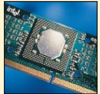
Powerful performance: the latest Intel® Celeron™ 466 and 500 MHz processors make light work of even the heaviest workload.