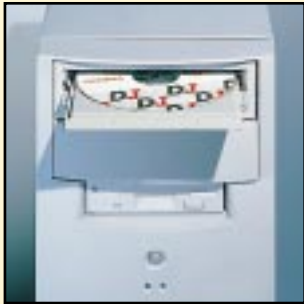
The Equium 3100M is also available with an optional 40-speed CD-ROM drive.