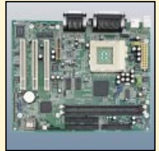
Ready for the future: a choice of upgrade and expansion options.