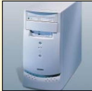
Office power in a stylish new design: the slimline Equium 3100M.