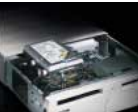
The hard disk can be upgraded or replaced with minimal interruption and no need for tools.