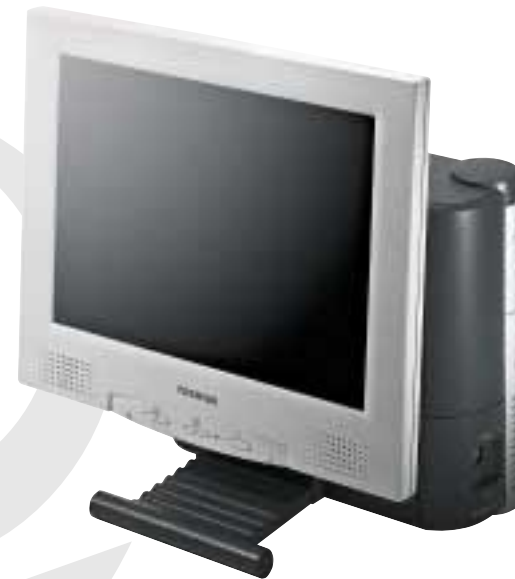
Innovative LCD Stand Kit gives you the option to attach up to 17" TFT monitor to the side of the PC.