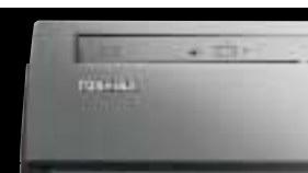
Slim-type CD-ROM and DVD-ROM drives contribute to the compact chassis.