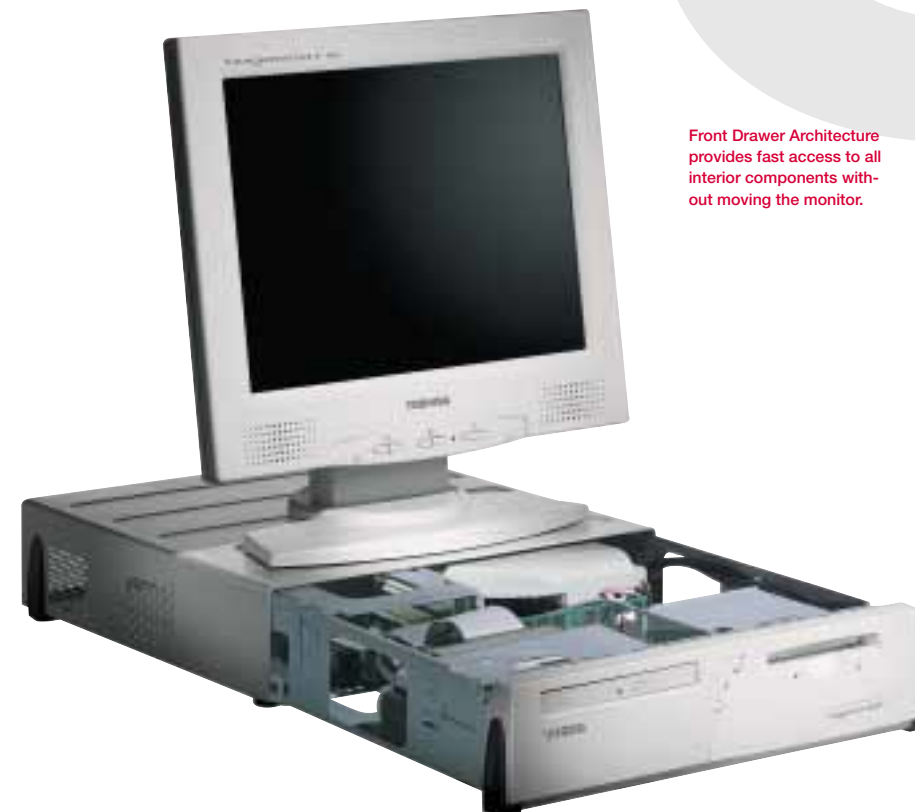
Front Drawer Architecture provides fast access to all interior components without moving the monitor.